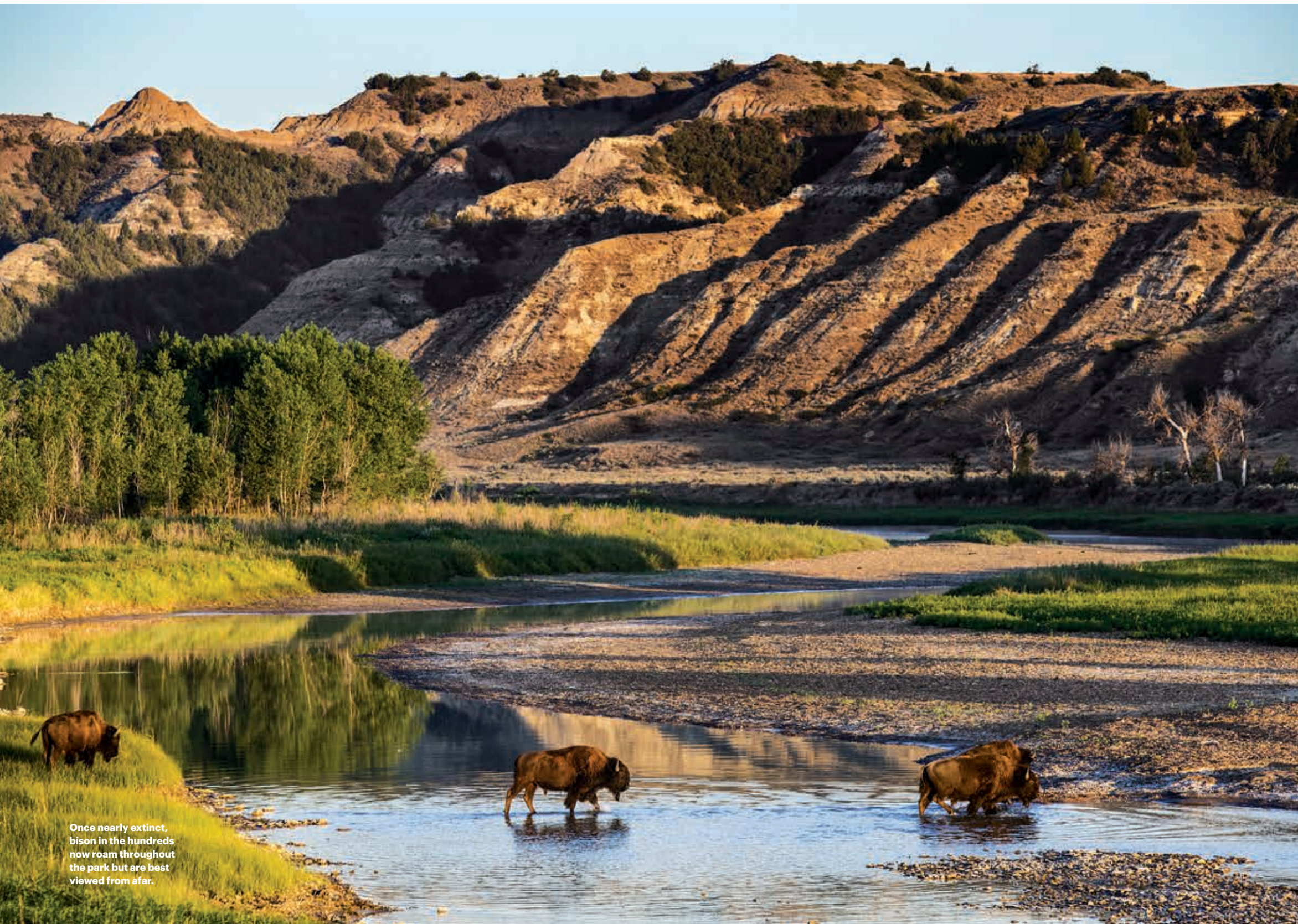
Once nearly extinct, bison in the hundreds now roam throughout the park but are best viewed from afar.

a trail not knowing what to expect—except that your curiosity will be rewarded.