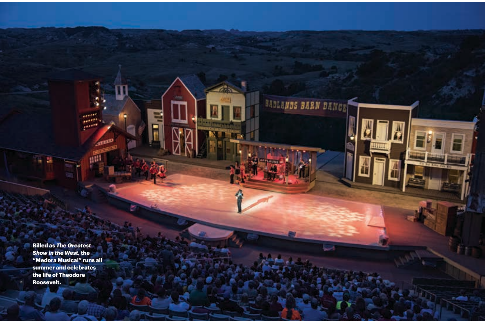
Billed as The Greatest Show in the West , the "Medora Musical" runs all summer and celebrates the life of Theodore Roosevelt.